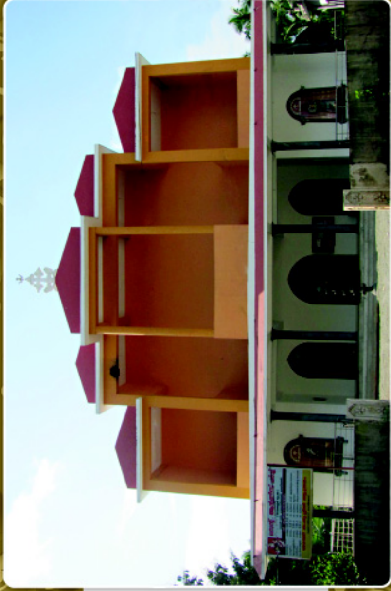
The Newly blessed St. Antony's Church Kundraithode, Kozhikode